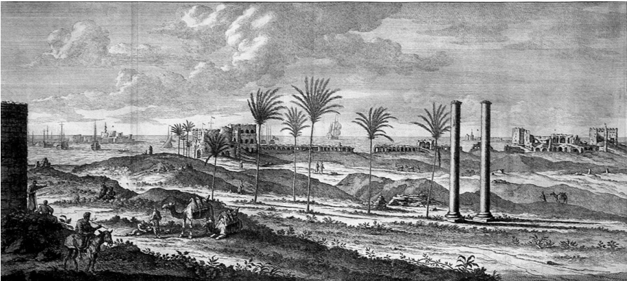
Figure 1.1. Panorama across the Great Harbour of Alexandria in 1681: engraving after a sketch by Cornelius de Bruyn

The forces of Islam secured Alexandria in AD642 and inaugurated a lingering decline of the greatest of Greek cities. For nearly a millennium almost nothing was said of the tomb in the written sources. By the late medieval period the urban area of the city had shrunk to less than a third of its extent in the time of Cleopatra and almost all that remained lay in ruins. However, from the early sixteenth century visitors began once again regularly to report the existence of a tomb of Alexander amidst the wasted vestiges of antiquity (Figures 1.1 & 1.2). Evidence is presented here, which firmly links this medieval tomb with a sarcophagus now displayed in the British Museum. Furthermore, there are intriguing connections between this relic and the Memphite tomb and also with the late Roman period when the Alexandrian tomb was destroyed.